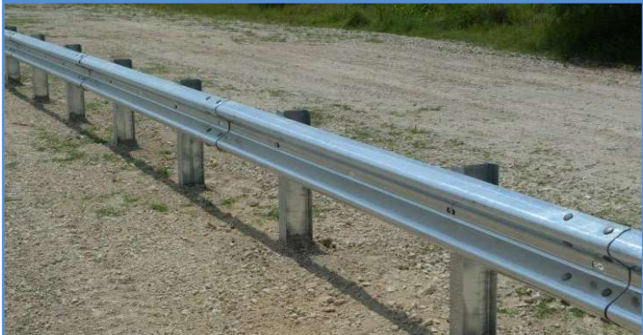
Metal Beam Crash Barriers