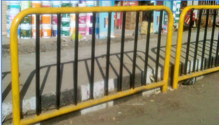
Tubular Guard Rails