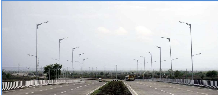
Electric Poles & Arm Brackets