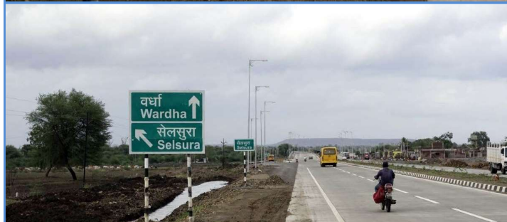
Road Safety Sign Boards